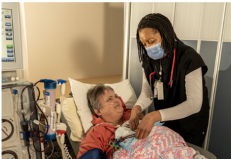
Dialysis Chairs - The replacement of 36 chairs in Oshawa and 27 chairs at our Whitby site will provide more comfort for patients.