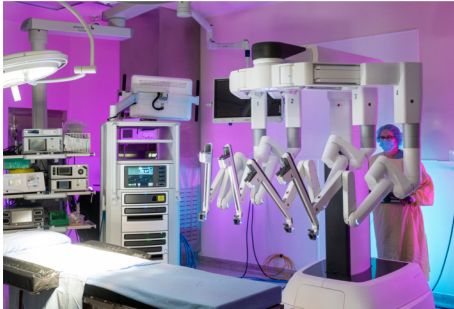
Surgical Robotics - A da Vinci surgical system has transformed cancer surgery for patients at our Oshawa hospital.

Gifts from donors like you have helped fund important equipment and capital upgrades at our Oshawa and Whitby Hospitals.