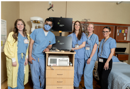
Fetal Monitor - A new fetal monitor was funded to help care for our tiniest patients and expecting mothers.